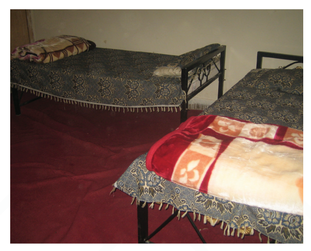
Clean and spacious rooms furnished with beds and clean sheets are provided to every child at Basera.